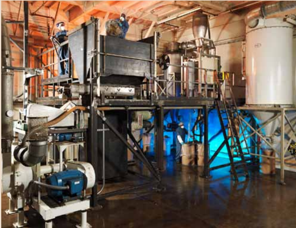
Our high-speed powder mill can produce up to 10,000 pounds of fine powder per shift.