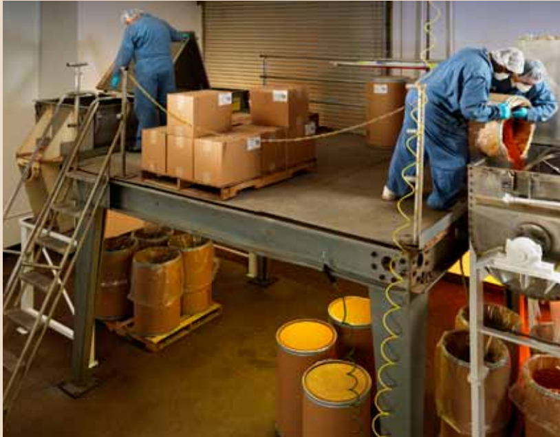
Our blending equipment has the versatility to produce from 100- to 3,000-pound batches.